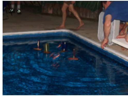
A typical confused start to the race. One small box fan was not much for wind.